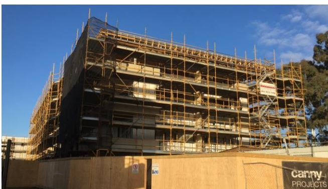
Above: Scaffolds erected for works on windows & external cladding