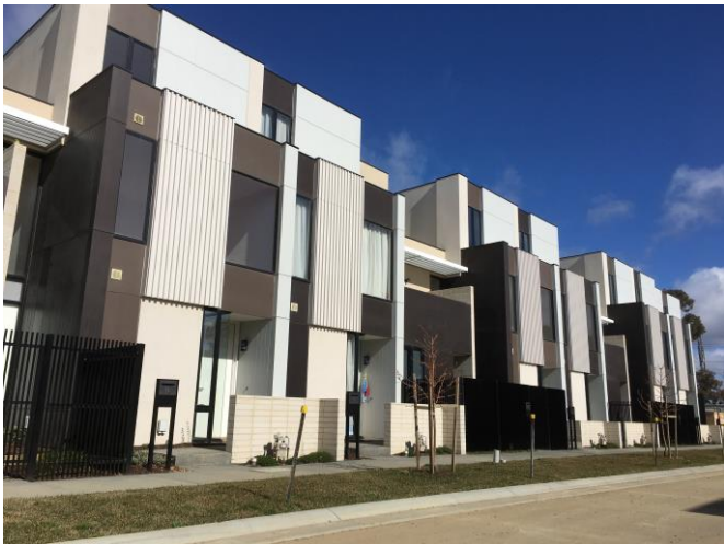
Above: First stage of townhouses complete with landscaping

Works are now progressing concurrently in all remaining stages; with completion and settlement for the balance of stages staggered throughout 2017 to January 2018, depending on each stage's status of progress. Specific status updates for each stage will continue to be sent to purchasers via the team at Property Settlement Solutions.