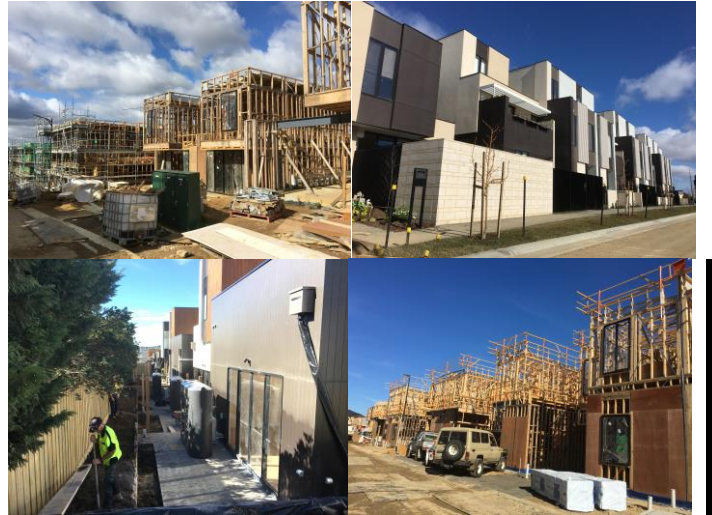
Above: Townhouses in various stages of construction

The townhouses due for construction completion in Stage 3 have internal plastering and fit-out works currently underway. All remaining stages have now progressed with timber wall framing completed in almost all houses. Although construction status varies on each individual home, works relating to roofing, external cladding and window installation can be seen completed in 75% of the remaining townhouses.