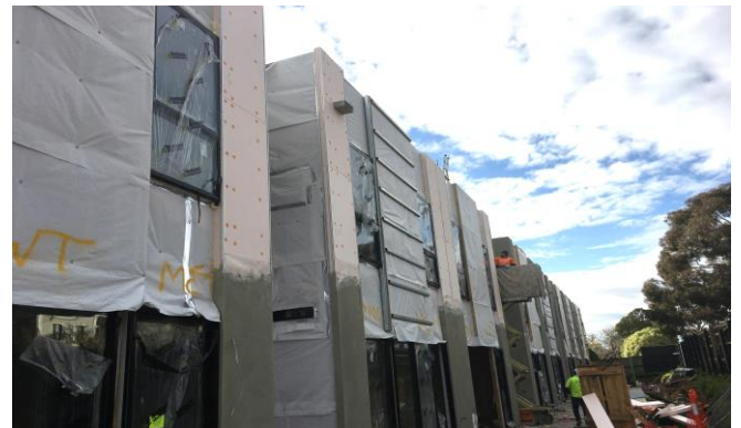
Above: External cladding on terrace homes underway

In the meantime, please do not hesitate to contact Property Settlement Solutions by calling Monique Maclean in their office on +61 3 8582 8972 or via email on monique@settlement-solutions.com.au , with any queries you may have relating to the settlement of the property.